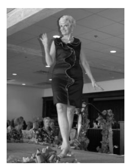
Fashions (and models) provided by The Country Ewe.